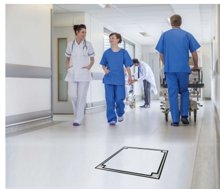
ACO Access Covers are ideal to use with a range of floor finishes

Call us now for sales and design support 01462 810421