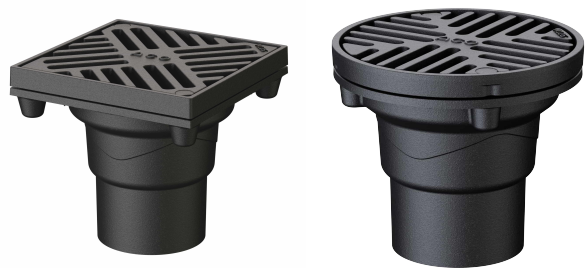
ACO Car Park Gullies are available in both round and square tops

PVC/PE/PP/Bitumen sealing options can be used.