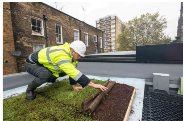
ACO RoofBloxx - create a sustainable blue/green roof drainage system