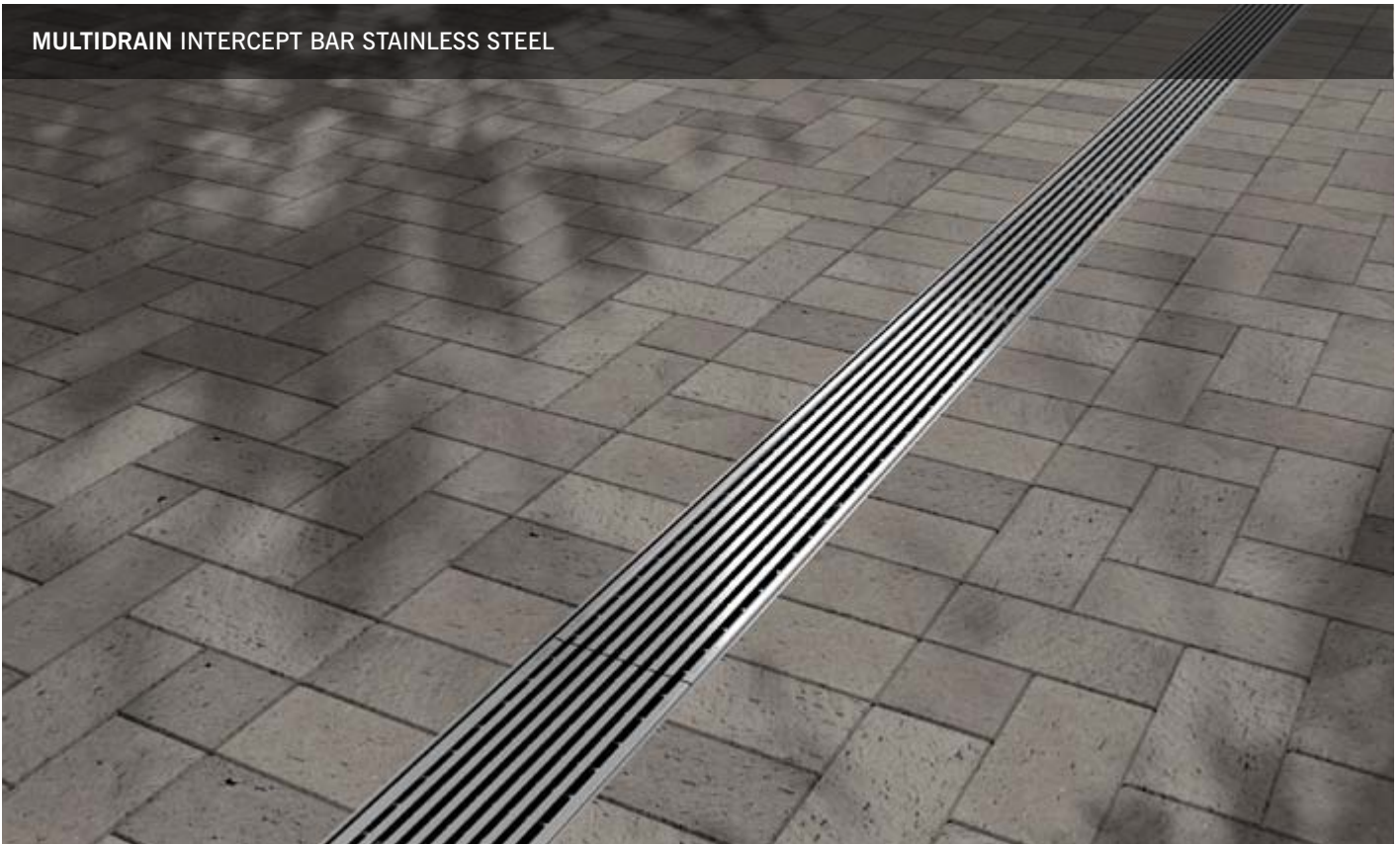
MULTIDRAIN INTERCEPT BAR STAINLESS STEEL